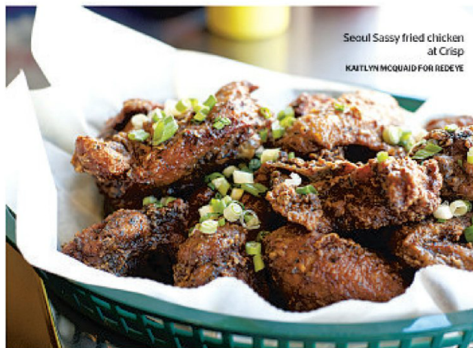
Seoul Sassy fried chicken at Crisp